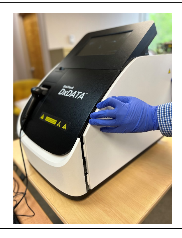
Step 3: Lift the door away from the instrument until you see the hinge below